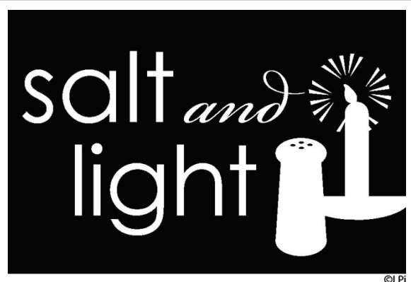
5<sup>th</sup> Sunday in Ordinary Time ~ 9 February 2020

Jesus said to his disciples: "You are the salt of the earth; but if salt has lost its taste, how can its saltiness be restored? It is no longer good for anything, but is thrown out and trampled under foot. You are the light of the world. A city built on a hill cannot be hidden." Matthew 5:13a-14